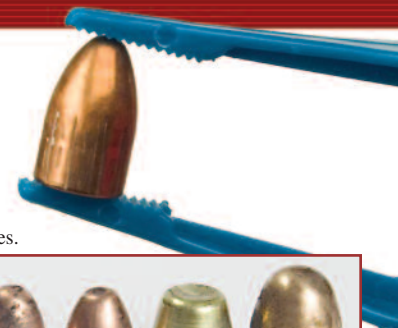
Actual collected samples.